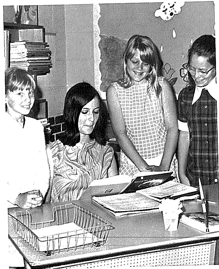
Now this is how you do it—