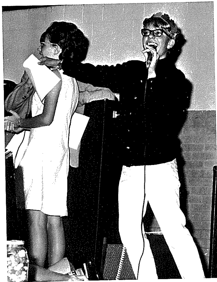
Who will bid for this young lady?