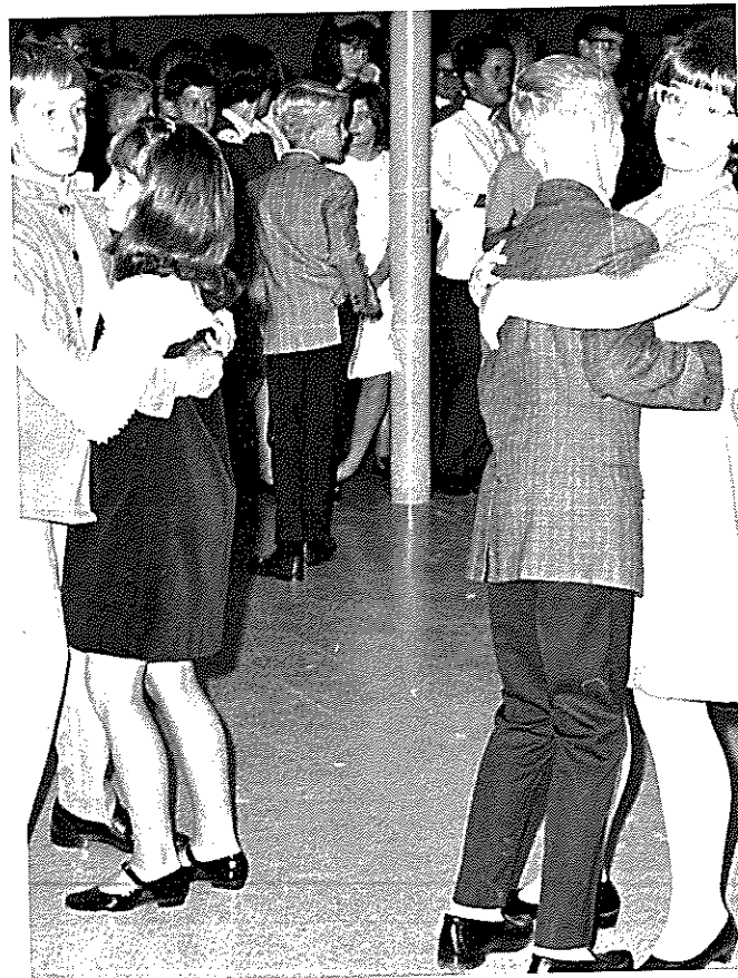
I could have danced all night—